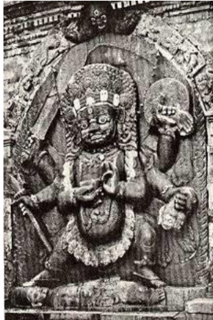
Bhairavar in a Nepal Temple

(This is an upgraded version of my original story that appeared in the May'06 issue of Om Saravana Bhava, a Tamil monthly published from Chennai)